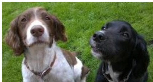
Cinnamon Bun Gotcha Day Cake

We hope you like our cinnamon bun Gotcha Day cake.